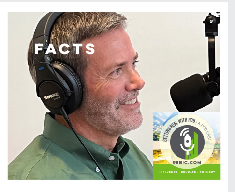
A PODCAST & BLOGS THAT HELP UNCOVER THE REAL STORIES