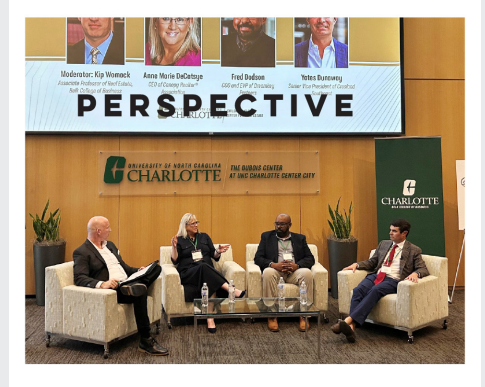
EVENTS THAT CONNECT YOU TO EXPERTS AND ALLIES